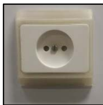
Fig. 1 EnerSpectrum socket disabled

photovoltaic installations dispersed through the island. In average 28% of the islands electricity is generated from renewable sources, a value that tends to grow in the winter with the increase in rain and wind.